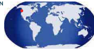
Gulf Islands, BC, Canada